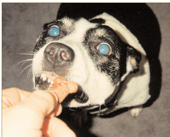
Green-eyed cookie monster

When played intelligently, physical games, such as play-fighting and tug-of-war, are effective bite inhibition and control exercises, and are wonderful for motivating adult dogs