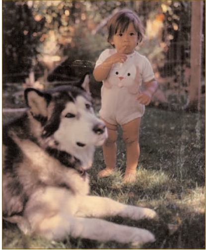
Children and puppies (or dogs) should never be left together unsupervised.

First, invite over only well-trained children. Supervise the children at all times. I repeat, supervise the children at all times. (Later on, puppy classes will offer a wonderful source of