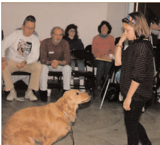
By coming when called and sitting on request, a puppy demonstrates willing compliance and shows respect to his trainer—a child.

Give children tasty treats such as freeze-dried liver as well as kibble to use as lures and rewards during handling and