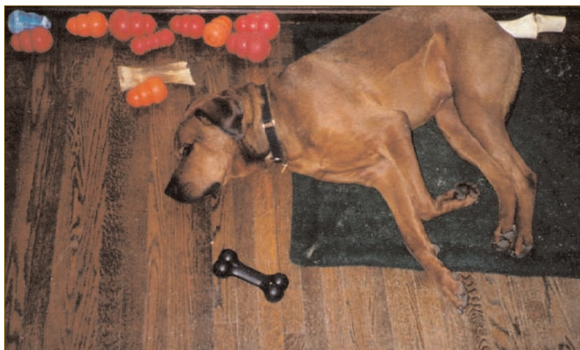
Claude Konged—peacefully passing the time when left at home alone (after chewing himself to sleep)

Give your puppy plenty of toys whenever leaving him on his own. Ideal chewtoys are indestructible and hollow (such as Kong products or sterilized longbones), as they may be