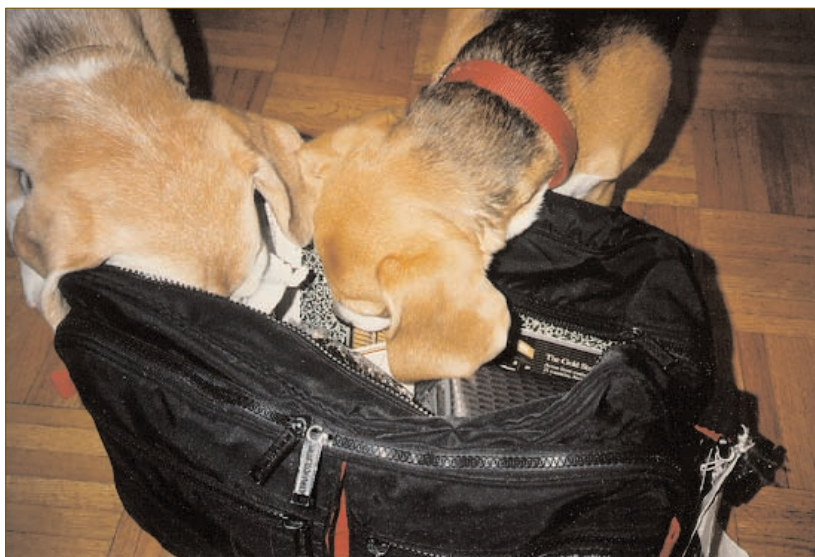
Beagles just begging to "unpack" a visitor's unattended luggage

Most doggy "disobedience" and wanton house destruction occurring in the owner's absence has nothing to do with separation anxiety. In fact, separation relief might be a more precise and descriptive term. The dog chews, digs, barks, and soils the house only when the owner is absent because he has learned it would be foolhardy to indulge in these pastimes when the owner is present. Owner-absent misbehavior is an indication that the owner has tried to suppress normal and natural dog behaviors with punishment, rather than teaching the dog how to behave—namely, how to express his basic doggy desires in an acceptable fashion. Often the term separation anxiety is an excuse for a dog who is simply not yet housetrained or chewtoy-trained.