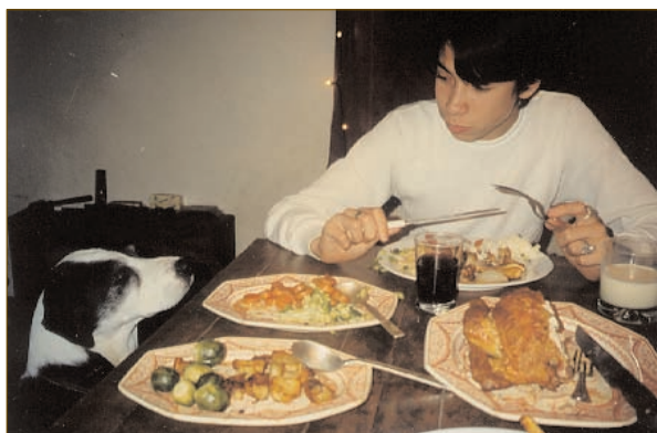
Teaching "Off" has many useful applications.

Basically, you have to teach your puppy that voluntarily relinquishing an object does not mean losing it for good. Your puppy should learn that giving up bones, toys, and tissues means receiving something better in return—praise and treats—and also later getting back the original object.