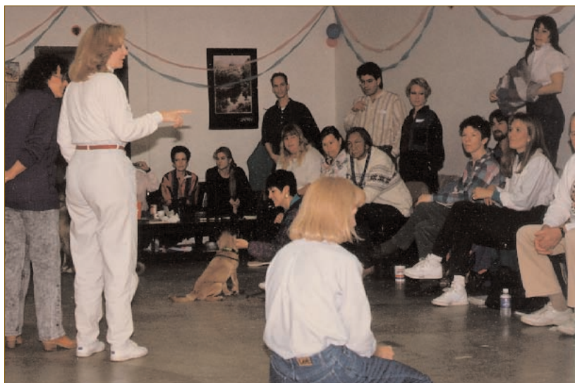
Not a bad start: eighteen people to meet one three-month-old puppy

Capitalize on the time your pup needs to be confined indoors by inviting people to your home. Your pup needs to socialize with at least a hundred different people before he is three months old. I know this may sound like a bit of an ordeal, but it is