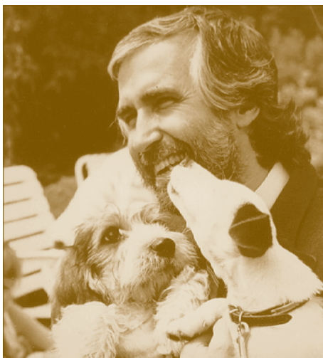
Puppy cuddle time.

Many adult dogs are more fearful of men than they are of women. So invite over as many men as possible to handle and gentle your puppy. It is especially important to invite men to socialize with your puppy if no men are living in the household. Make sure you teach all male visitors how to handfeed kibble to lure/reward your pup to come, sit, lie down, and roll over. Add a few extra tasty treats to each male visitor's bag of training kibble so that your puppy forms a fond and loving bond with men.